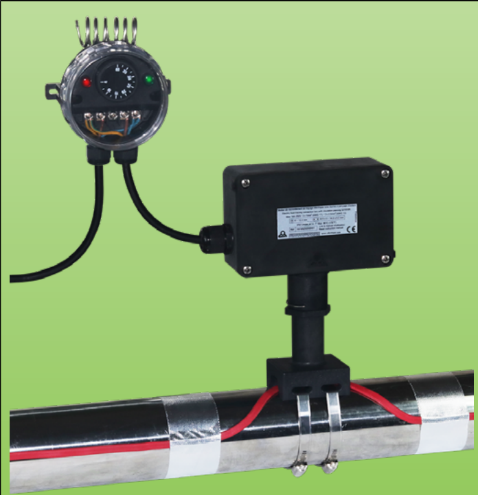
Example of assembly on 3 or more heat tracing cables, in combination with Y25 connection boxes